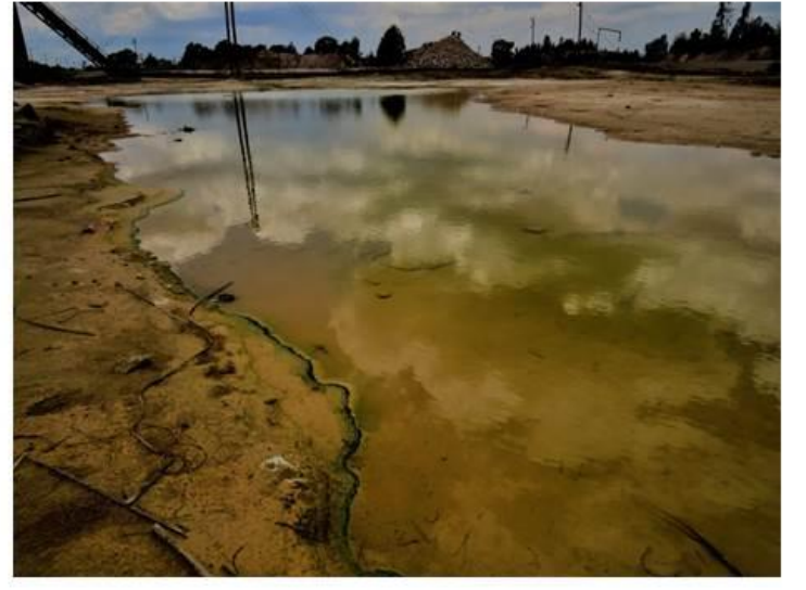
The high level of copper in the water can be seen as a green residue around the edges of this puddle in a tailing.

focused more closely on the resources available for research into the theme. The learner has used the physical environment, landscapes and damaged equipment as sources for exploration. The learner carefully controls the use of colour and texture in the landscape photographs demonstrating their understanding of aesthetics and formal elements. The powerful depiction of pipes standing in water makes used of visual language to express the industrial impact the learner is seeking to communicate. This indicates an understanding of drawing for design. The learner clearly demonstrates an understanding of formal elements in the bold use if lines and circles in the photograph of pipes in water.