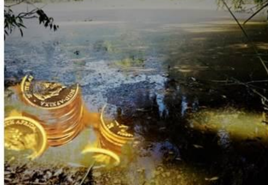
All my photos were edited in the GIMP platform to create the effects seen here.

Here, the learner has acknowledged the technical influence of another artist. The learner has used the process of digital manipulation to create images which combine ideas and develop the theme. The learner makes use of design theories of harmony, order and balance – in reverse, to create contrasts. The learner presents images of pipes, a dam and coins in a disorderly relationship. The learner seeks to visually represent an imbalance within a sustainable environment.