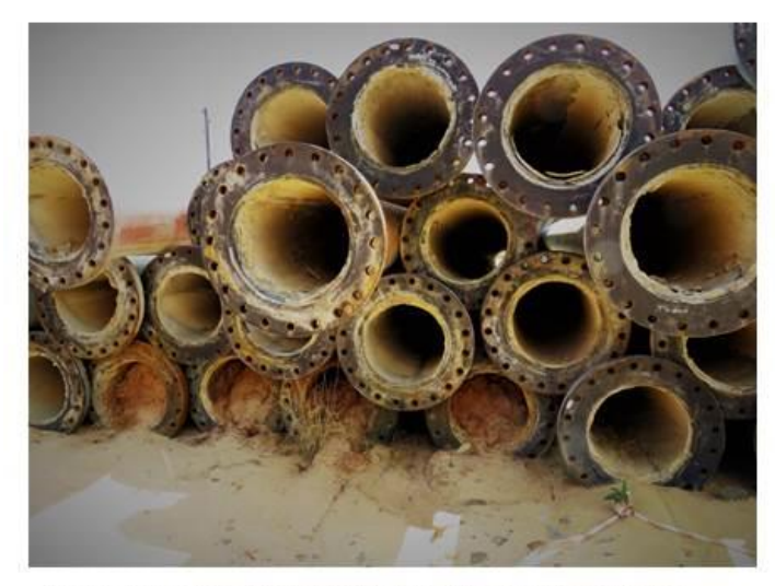
Pipes that carry the harmful water from the mines and tailings to dam sites are littered around the lands. As the photographs show they are layered with the sediments of the heavy metals.